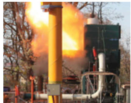
About 5 milliseconds later, the dust ignites and the vent opens.