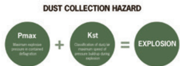
Figure 2: Kst values of common dusts