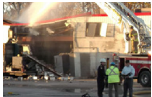
Explosion at Veolia Environmental Services in Sarnia, Canada