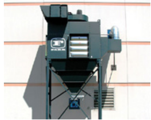
This heavy duty dust collector with explosion vent is designed to survive a combustible dust explosion with minimal damage.