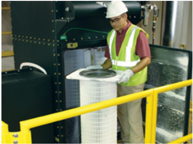
Figure 5: Vertically-mounted dust collector filters

The NFPA uses relatively conservative textbook calculations in its standards for explosion protection equipment, and justifiably so. However, as noted earlier on page 5 (see performance-based codes), the NFPA also allows real-world destructive test data to be used in place of its own standard calculations, provided the dust collection supplier can provide adequate data to prove that the collection system is designed to meet a specific set of criteria for a given situation. The use of real-world destructive test data is thus a permissible and sometimes overlooked strategy.