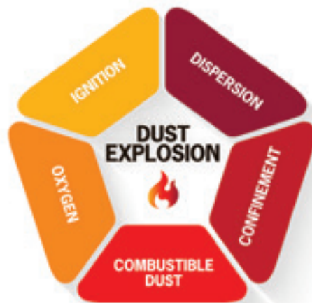
Figure 1: Dust explosion pentagon shows the elements that must be present for a combustible dust explosion to occur.

NFPA: The NFPA sets safety standards, amending and updating them on a regular basis. As noted, when it comes to combustible dust, there are several different documents that come into play, as summarized in the section directly below. Together these standards add up to total protection to prevent an explosion, vent it safely, and/or ensure that it will not travel back inside a building. Most insurance agencies and local fire codes state that NFPA standards shall be followed as code.