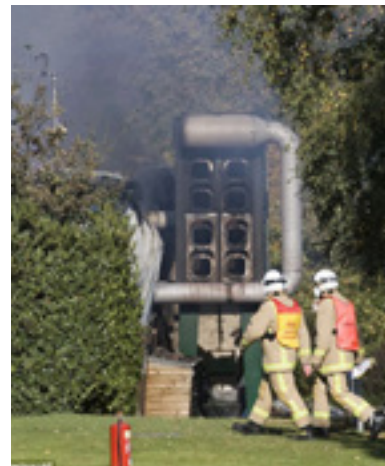
Toner dust explosion in the UK.

Performance-based provisions state specific life safety objectives and define approved methods to demonstrate that your design meets these objectives. They give equipment manufacturers and plant engineers greater flexibility by allowing methods to quantify equivalencies to existing prescriptive-based codes or standards, as long as the proposed solution demonstrates compliance.