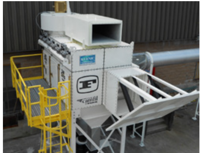
This dust collector is equipped with an explosion vent with vertical upblast deflector plate. Other safety features include a sprinkler system and filters with special carbon-impregnated media for static dissipation.

These devices divert the flame front to atmosphere and away from the downstream piping. Typically, flame front diverters are used between two different dust collectors equipped with their own explosion protection systems. The flame front diverter is used to eliminate "flame jet ignition" between the two.