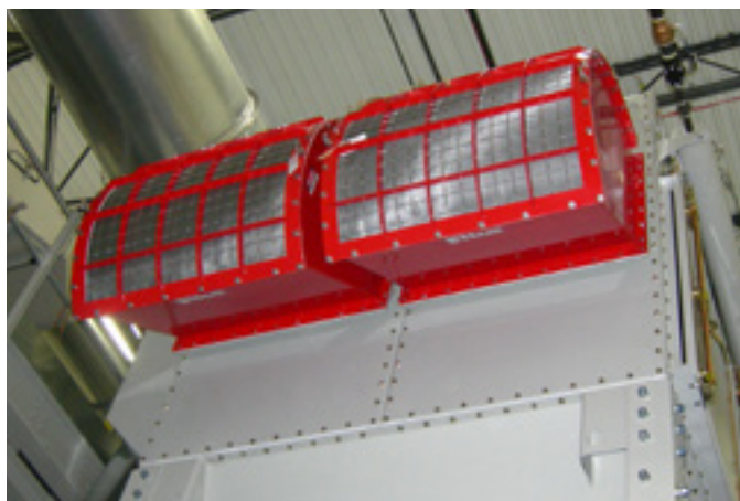
Figure 4: Flameless venting device