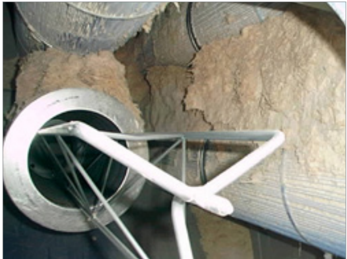
Figure 6: Horizontally-mounted dust collector filters