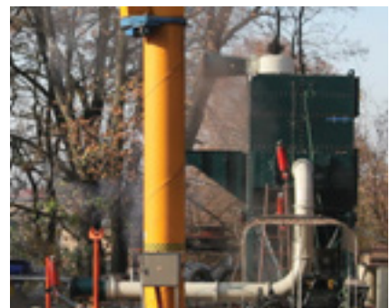
The smoke quickly clears. The whole event took about 150 milliseconds.