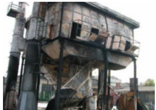
Dust Collector After Explosion