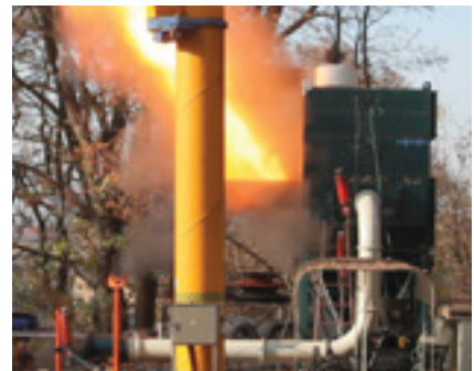
The flame is almost immediately diverted away from the dust collector to a safe area.