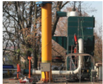
At the startup of a staged explosion, explosive dust is injected into the dust collector to create a flammable cloud.

It is important to regularly inspect the collector, connected duct work, and the surrounding safety zone. You should inspect all of these according to each manufacturer’s installation and operation manual. Also, you should remove any dust build-up within the system, duct work, or safety zone as often as possible.