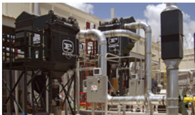
These dust collectors are equipped with passive and active controls that include an explosion vent and ducting, as well as a chemical isolation system mounted on the inlet duct.