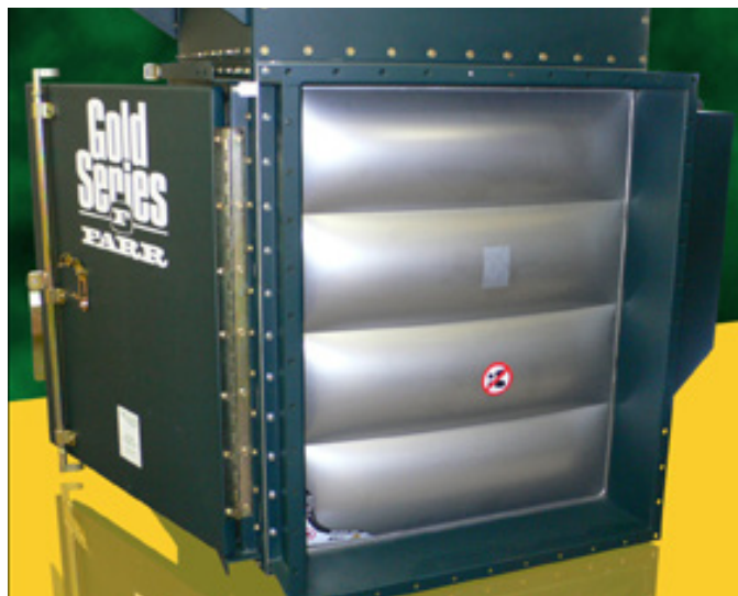
Figure 3: Explosion venting device

A passive float valve is designed to be installed in the outlet ducting of a dust collector. A mechanical barrier prevents flames from propagating further upstream through the ducting. The mechanical barrier reacts within milliseconds and is closed by the pressure of the explosion.